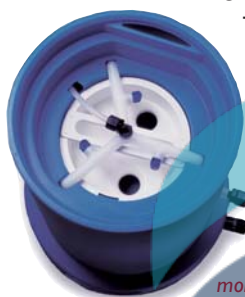
molded polyethylene spray manifold

The Pulsar 3 Chlorinator is used with a timer or any ORP-based pool automation unit. The easy to maintain Pulsar 3 Chlorinator uses a unique spray concept that enhances your pool's filtration system, helping to make your pool water sparkle. A 3/4 hp pump provides 27psi through the venturi for optimal evacuation of the chlorinator.